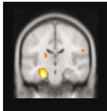
FIGURE 1. Results of the High vs Low comparison in positron emission tomography (PET) data pooled across all participants. The coronal image displays regional cerebral blood flow (rCBF) increases in left hippocampus ( z = 3.88 ; MNI coordinates x,y,z = -24, -18, -22 ) superimposed on a canonical SPM99 T1 template. This image is displayed according to neurological convention.

A voxel-wise Condition \times Group interaction revealed rCBF increases in the High vs Low Recall comparison that were greater in the Control group than in the PTSD group: hippocampus ( z = 2.40 , MNI = -28, -16, -24 ), fusiform gyrus ( z = 3.24 , MNI =