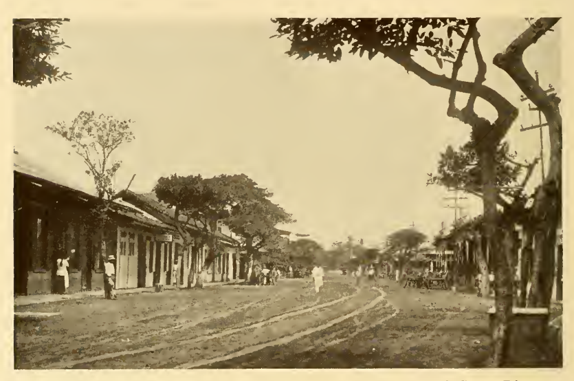
FIG. 57.-Street scene in Puntarenas, the Pacific port of Costa Rica.

rail from this point in the semi-arid coastal plain to the capital, San José, lying at an altitude of 1,140 meters in the cool meseta central , is through a region remarkably diverse as to physiography. From San José three principal trips were made: First, to La Palma, a classical botanical locality on the cloud-drenched southwestern slopes of Irazú volcano; next to Santa Clara, in the mountains a few leagues south of Cartago; then to Vara Blanca, lying high up in an almost unexplored region between the volcanoes Poás and Barba. Special attention was here given to ferns and orchids, both groups being