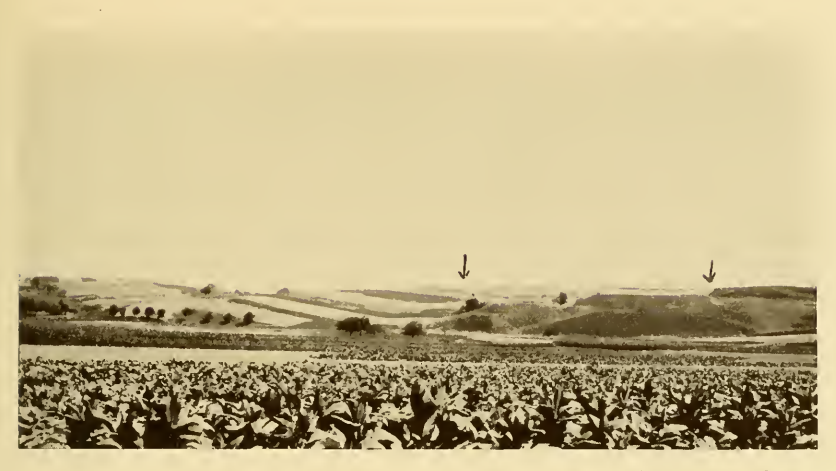
FIG. 59.—The Mauer site from a distance. The heaps in front are refuse from the quarry.