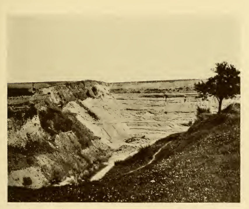
FIG. 60.—Part of the Mauer sand and gravel quarry as it appears today.