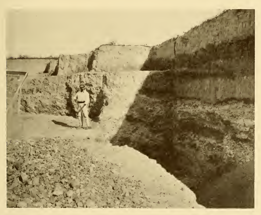
FIG. 58.—Gravel beds yielding ancient paleolithic stone implements in the Low Somme Terrace at Montier, suburb of Amiens. Most of the stones showing work of man are found in the very lowest layers of the gravel, as seen in the pit at the right. (Photograph by A. H., July, 1923.)

The next visit was to the two museums at Brussels which contain valuable collections relating to early man, namely, the National Museum and the Cinquantenaire. Both these very profitable visits were made under the guidance and with all possible assistance of Professor \Lambda . Rutot, who also arranged an excursion to the but little-